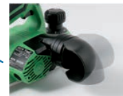
Optional Elbow (334503) suits P20ST and P20SF