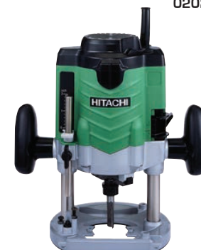
M12SE(H1) 12mm Single Speed Router 02025796