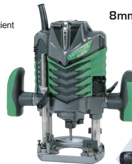
M8SA2 8mm Single Speed Router

Fine adjustment knob available separately 318304