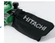
Optional Dust Bag (322955) suits P20ST and P20SF