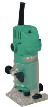
M6SB 6mm Trimmer